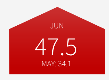
LAST TWELVE MONTHS